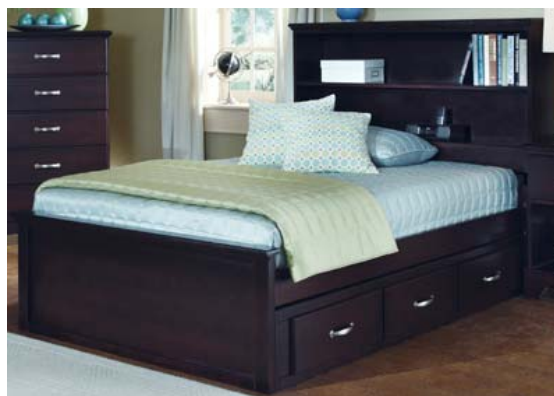
(bed rails locked high with Three Drawer Storage unit)