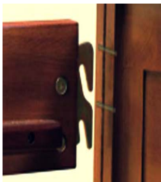
(hook & pin connection)

To set up these beds we use a hook and pin connection between the headboard and footboard. Metal pins are embedded within the headboard and footboard at two positions making it easy to switch from upper height to lower height. (see photo below) To use the under bed storage unit with beds, we mount the wooden side rails at the high locking position in the headboard and footboard. (see photo below) Next, install the bed slats. Our beds rails come standard with wood slats to support a box spring/mattress or bunkie board/mattress combination and will not support a mattress only set up. We recommend a bunkie board when setting up to use with the Three Drawer Storage Unit. Set the bed high to use the storage unit, or set it low for use with mattress and foundation without the storage unit. (see photo below)